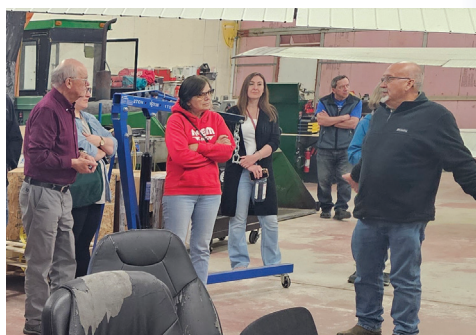
NCEM missionaries touring the Aviation Hanger during Central Conference

The missionaries could worship, laugh, cry, commiserate with and encourage each other. Sometimes they just were a listening ear. We all were challenged by the guest speaker who taught the Scriptures. Conference is so valuable for the missionary and I just want to say thank you for your part in encouraging the missionary.