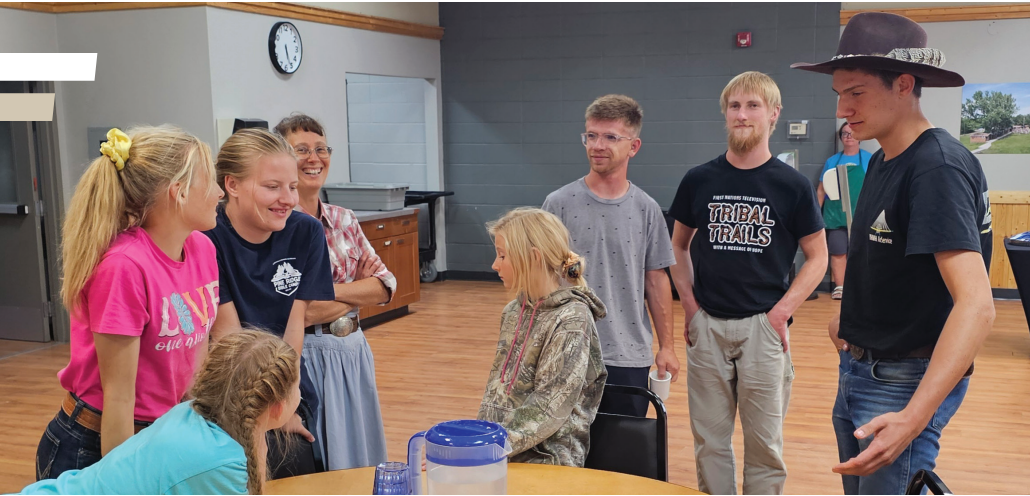
NCEM missionaries and interns with Western Conference childcare workers