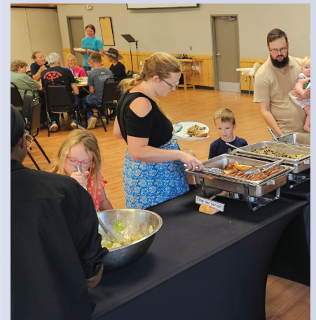
Missionaries enjoying the available buffet at Western Conference

All these things are good for the soul, and missionaries need this time to be refreshed. As it says in Proverbs 11:25, "The generous will prosper; those who refresh others will themselves be refreshed."