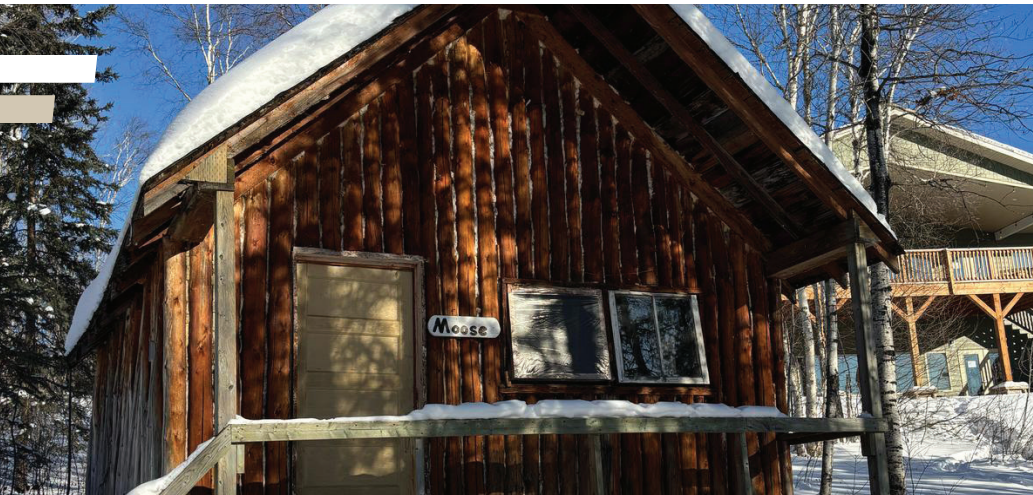
The oldest cabin at PRBC in need of replacement