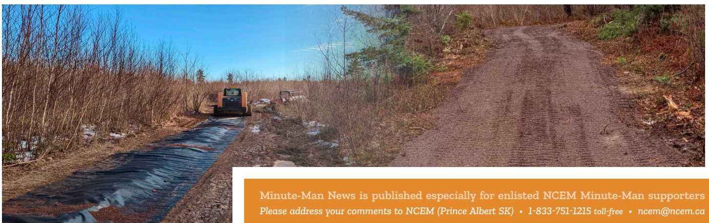
(below) Arrowhead Center begins building bike/walking/snowshoe/cross-country ski trail ... (below right) Fresh gravel on new trail.

There is anticipation that this project may be completed soon and will be used in all four seasons for various activities.●