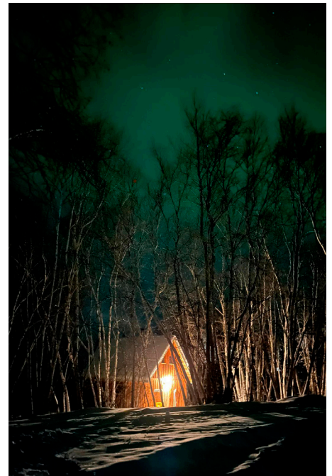
(above) Drawing of new cabin planned for Pine Ridge Bible Camp ... (above right) Winter scene at Pine Ridge.