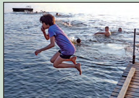
Waterfront fun last summer at Pine Ridge.