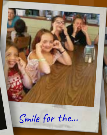
Smile for the...