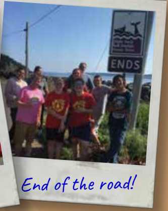
End of the road!

At Arrowhead our summer camps provide a safe and exciting environment for children and youth ages 8 to 18. Our camp days are packed with games, challenges, gathering time, bible lessons, camp fire, waterfront, crafts and activities. Summer camp is an incredible experience for kids and we are so pleased to be able to be a part of it, to see young people form new, lifelong friendships and make unforgettable memories; and we feel so privileged to be able to share with them from God's Word, the Holy Bible. If you have any questions about any of our camps please feel free to contact us, we would love to talk to you.