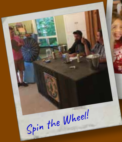
Spin the Wheel!