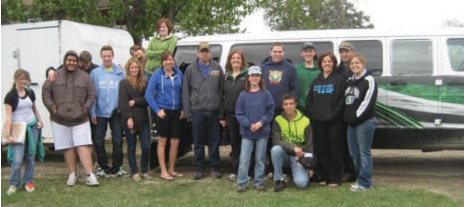
This team travelled to Cumberland House, northeast Saskatchewan, for weekend ministry. Big River Bible Camp's recently purchased van (pictured here) helped make the outreach possible.